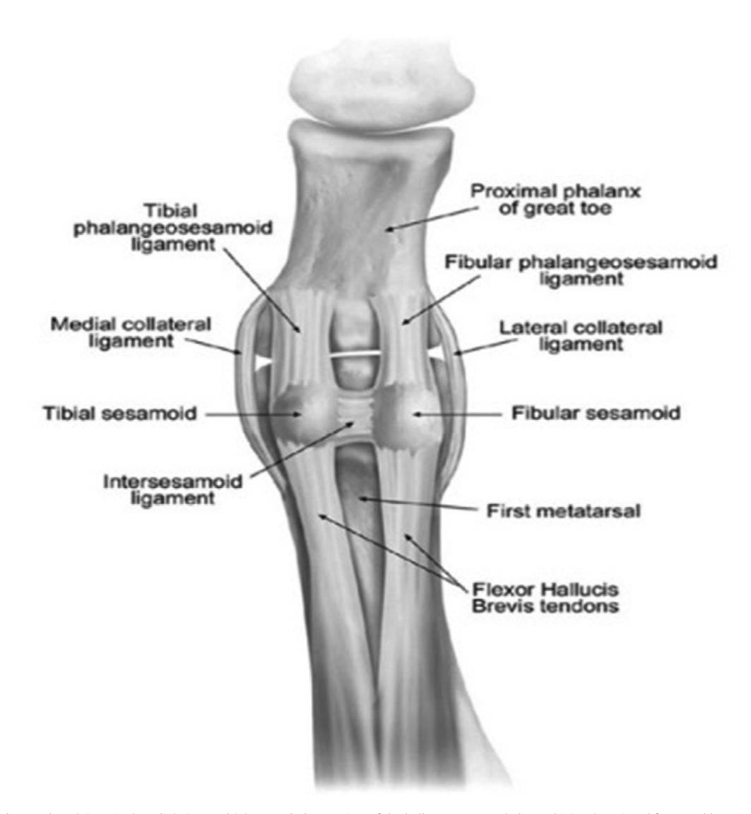
Fig. 2. Anatomy of the plantar plate. ( A ) Sagittal medial view and ( B ) coronal plantar view of the hallux metatarsophalangeal joint. (Reprinted from Waldrop et al. Foot Ankle Int. 2013; 34: 403-408).

study group, we compared each player's 3 seasons prior to the control year, the control season (2012) and the 2 seasons immediately following (Table 2).