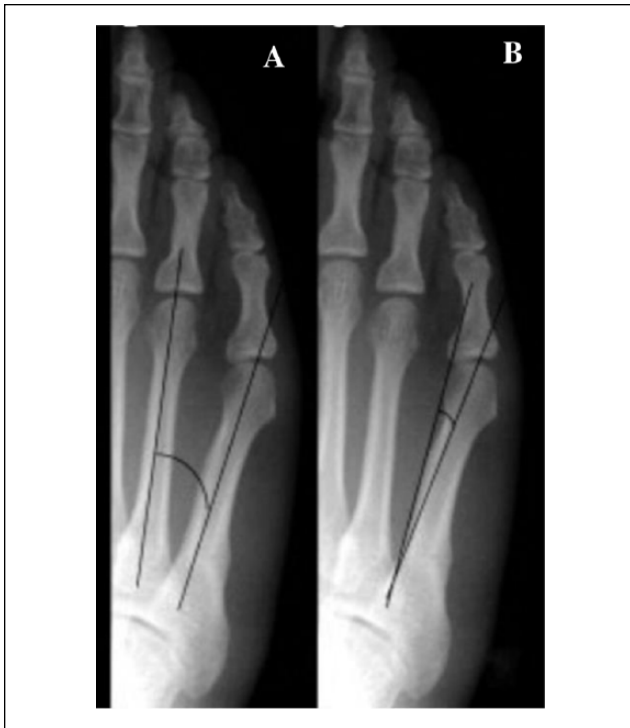
Figure 1. Anteroposterior radiograph measurements. (A) fourth-fifth intermetatarsal angle, (B) fifth metatarsal angle.